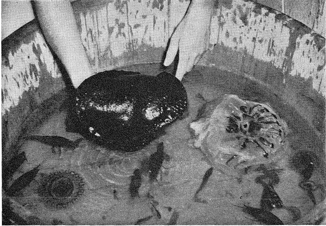
Fig. 1. The content of the trawl from the pelagic haul made by the Galathea in the South China Sea at an estimated fishing depth of 3400-3800 m. Eynpiastes globosa n. sp. floats in the tub. Galatheathuria aspera (Théel) is lifted up with the oral side upwards.

swimming, though its primary function probably is to offer a larger surface for resting on the soft mud.