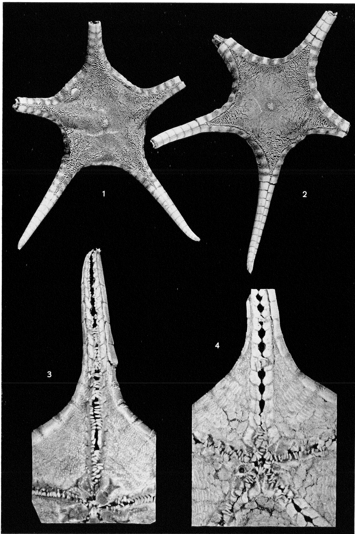
Plate III. Hyphalaster inermis , 1-2, st. 282, nat. size. 3-4, st. 193, part of ventral side of two different specimens, in 4 × nat. size.