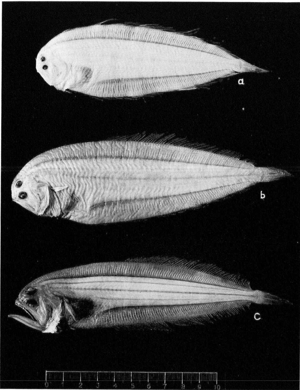
Fig. a. Paratype of Chascanopsetta galathea , std.l. 122 mm. St. No. 202. (An example of column B, Table 3). Fig. b. Paratype of Chascanopsetta galathea , std.l. 148 mm. St. No. 202. (An example of column C, Table 3). Fig. c. Holotype of Chascanopsetta galathea , std.l. 144 mm. St. No. 202. (An example of column D, Table 3).